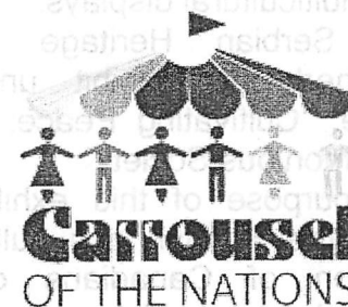
EXHIBIT: "CULTIVATING PEACE: BUILDING A HARMONIOUS SOCIETY"