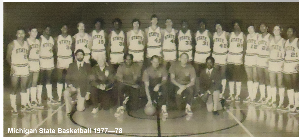
Michigan State Basketball 1977—78