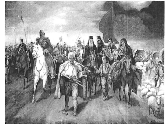
Exhibit: From the Serbian past